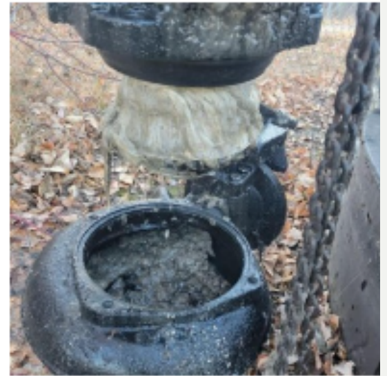
A pump clogged with wipes

Helping us by doing your part, helps preserve the enviroment and our sewer system