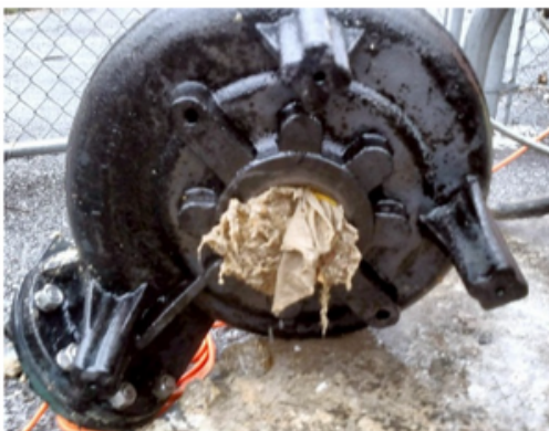
Pump clogged with wipes and feminine hygiene

This will help to reduce maintenance and repair cost, thus saving you from a hefty bill or rate increases to cover these expenses.