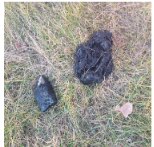
A chunk of wood and a pile of hair causing a blockage in a pump