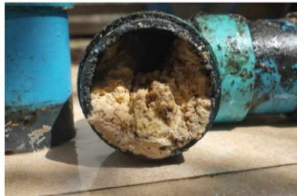
Pipe clogged with grease